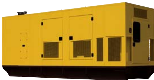
Enclosure pictured may include optional accessories

These sound attenuated enclosures are a result of continuing research and development by our specialist acoustic engineers.