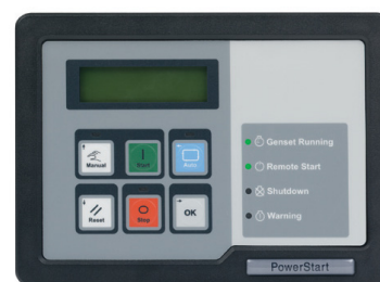
PowerStart 500 control operator / display panel

Note – An RS-232 or USB to RS-485 converter is required for communication between PC and control.